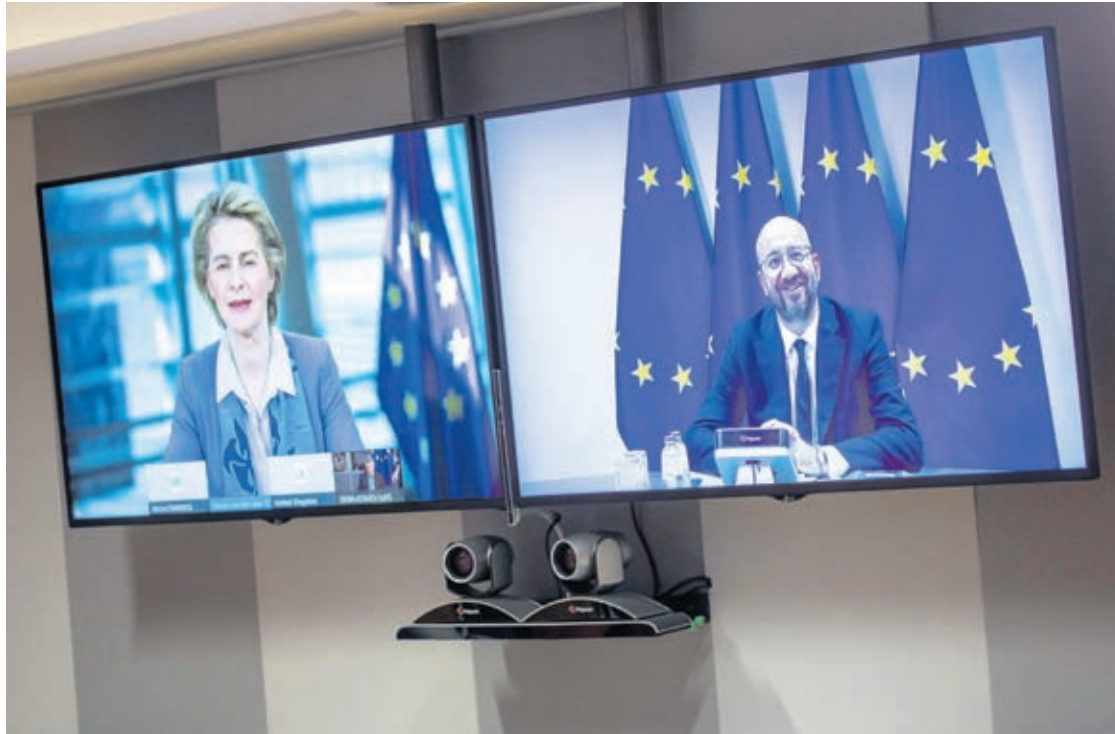
European Council President Charles Michel, on screen right, speaks via videoconference to European Commission President Ursula von der Leyen, screen left, prior to EU-UK talks via videoconference at the European Council building in Brussels on Monday, June 15, 2020.

Though the talks have made little headway, Britain appears to have softened its combative stance toward the EU. Johnson